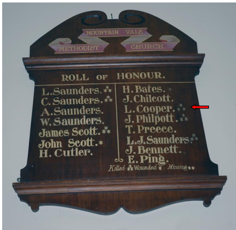
Mountain Vale Methodist Church Roll of Honour

L. Cooper is remembered on the Mountain Vale Methodist Church Roll of Honour, located in Liffey Baptist Church, 1807 Liffey Road, Liffey, Tasmania.