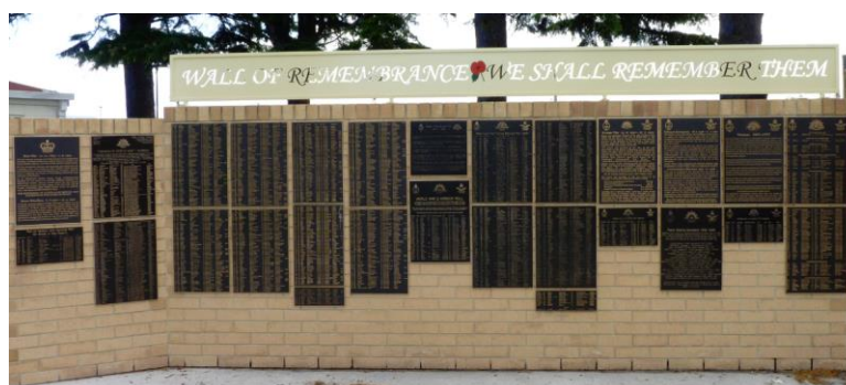
Wall of Remembrance, St. Helens, Tasmania

"What these men did nothing can alter now. The good and the bad, the greatness and the smallness of their story will stand. Whatever of glory it contains nothing now can lessen. It rises, as it will always rise, above the mists of ages, a monument to great hearted men; and for their nation, a possession forever. "