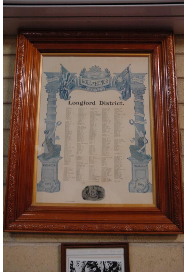
Longford District Roll of Honour

L. Cooper is remembered on the Mountain Vale Methodist Church Roll of Honour, located in Liffey Baptist Church, 1807 Liffey Road, Liffey, Tasmania.