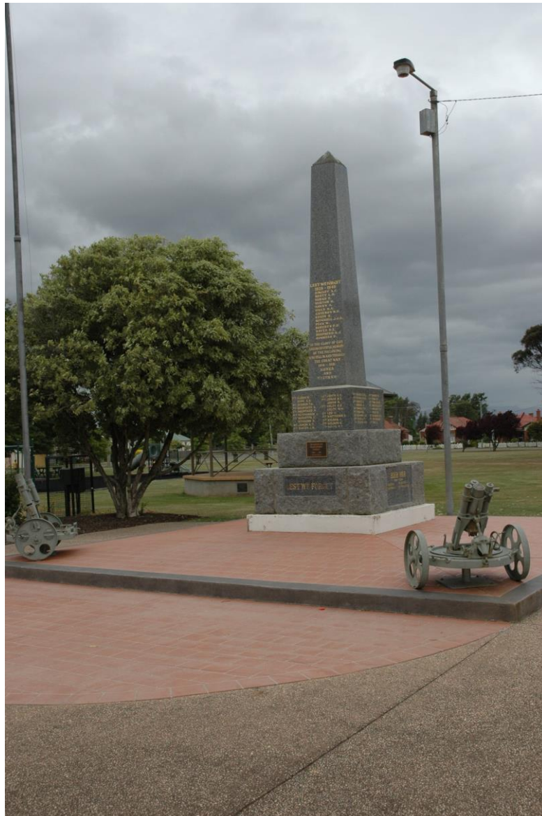
Longford War Memorial