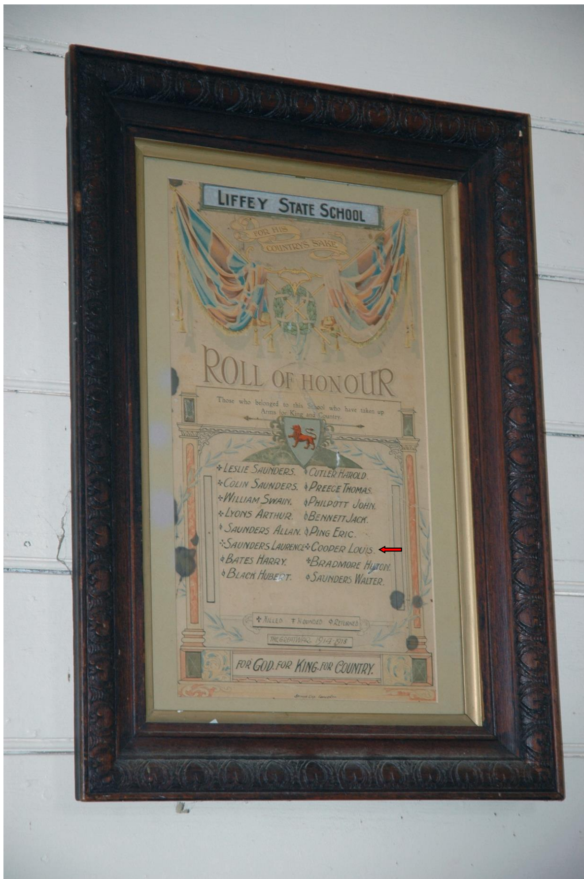
Liffey State School Roll of Honour