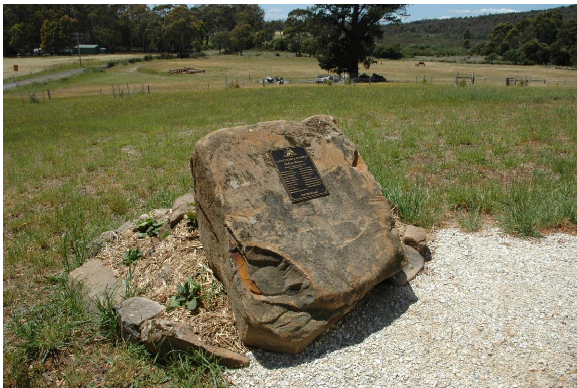
Liffey Commemorative Trees