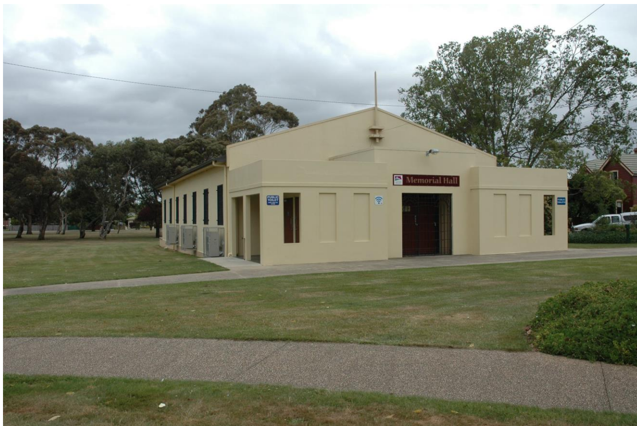
Longford Memorial Hall (above) & Mothers in Sympathy & in Memory of those Sons from Longford Roll of Honour (below)